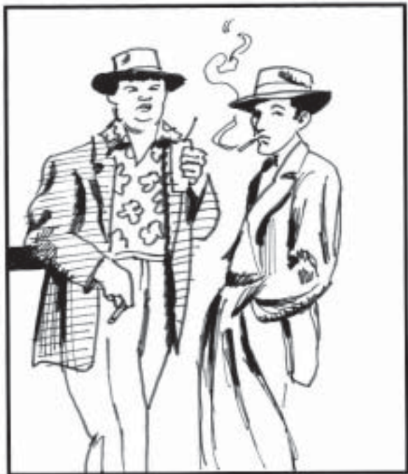
A pair of stags.