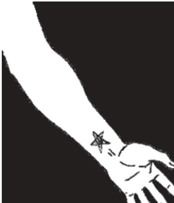
A star was tattooed on his left wrist.